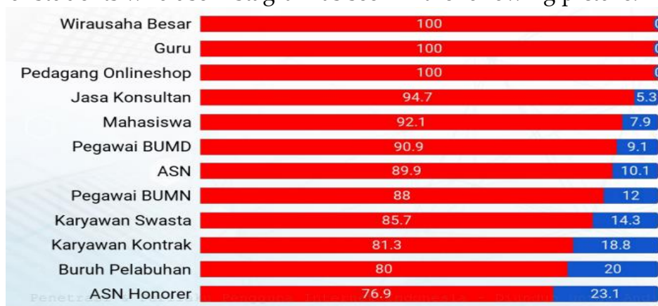
Figure 2. Internet Users by Occupation (Tim Penulis, 2018)

The activity will sharpen and familiarize students to record and write down various stories and their individual experiences on their accounts. Repetition of these activities will train and improve their skills in writing recount text on Instagram. This context is a strength as well as the main capital for improving the writing skills of nursing students in writing the events they experience. This is supported by the number of students who use Instagram as seen in the following picture.