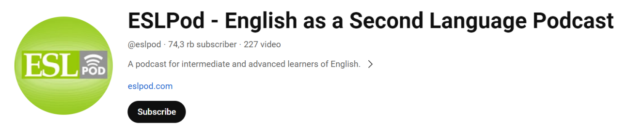
Figure 2. English as a Second Language (ESL) Podcast YouTube channel

This podcast focuses on a variety of everyday topics and covers vocabulary and grammar with easy-to-understand explanations.