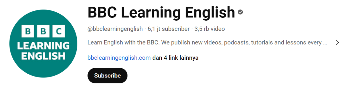
Figure 1. BBC Learning English YouTube channel

BBC Learning English provides a variety of podcasts specifically designed for English learning. They cover topics such as news, culture, grammar, and speaking skills.